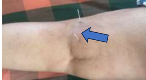
Figure 2: Dry Needling Practice

suggested that dry needling was effective in post TKA, but in this study dry needling shows the satisfactory results towards arthrofibrosis which develop after TKA.